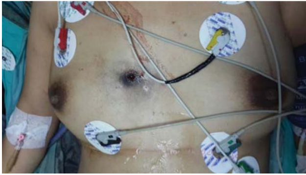
Fig. 1 The entrance hole of the bullet with ~1 cm diameter on the right anterior 4th intercostal space, 2 cm lateral to the sternum.