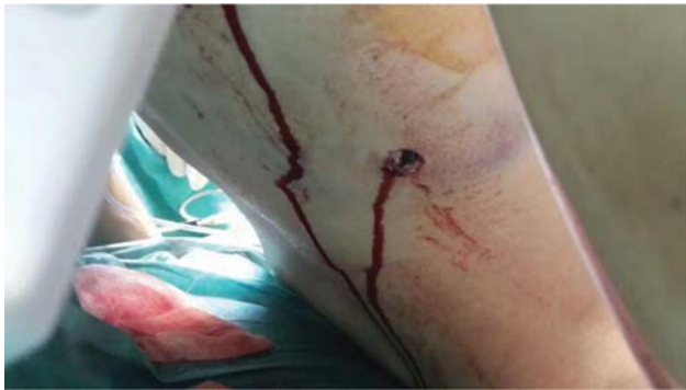
Fig. 2 The exit hole of the bullet with ~3 cm diameter on the right posterior 12th intercostal space on the midscapular line.