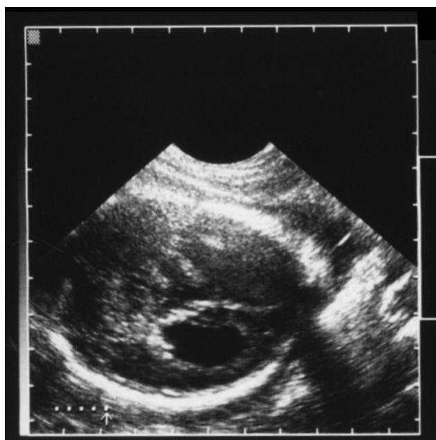
Fig. 2 Ultrasound image of cerebral ventriculomegaly and periventricular calcifications.

When calculating the validity of the PCR compared with the gold standard, the diagnosis of congenital toxoplasmosis through the follow-up of the newborn until 1 year with clinical evaluations and complementary tests, we found a sensitivity and a negative predictive value of 100%, a specificity of 92%, and a positive predictive value of 50%.