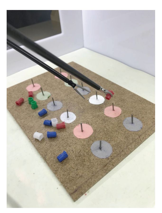
Fig. 4 Training module 3.