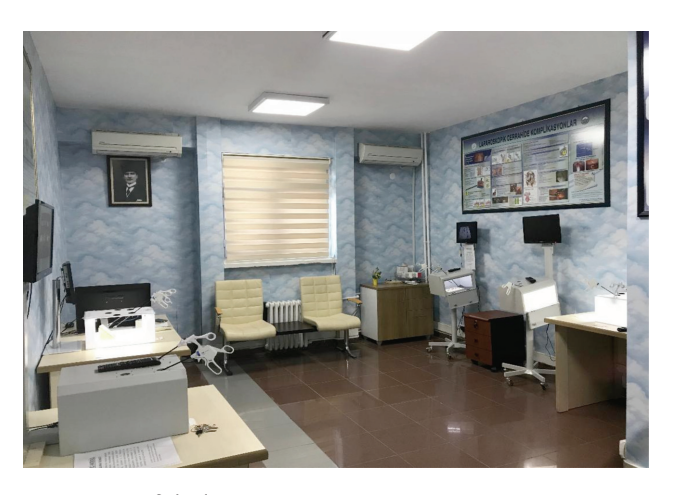
Fig. 1 View of the laparoscopic training room.

In ►Fig. 2 , the training module (TM) 1 is presented. In this TM, the surgeon should attach the rings to the nails while