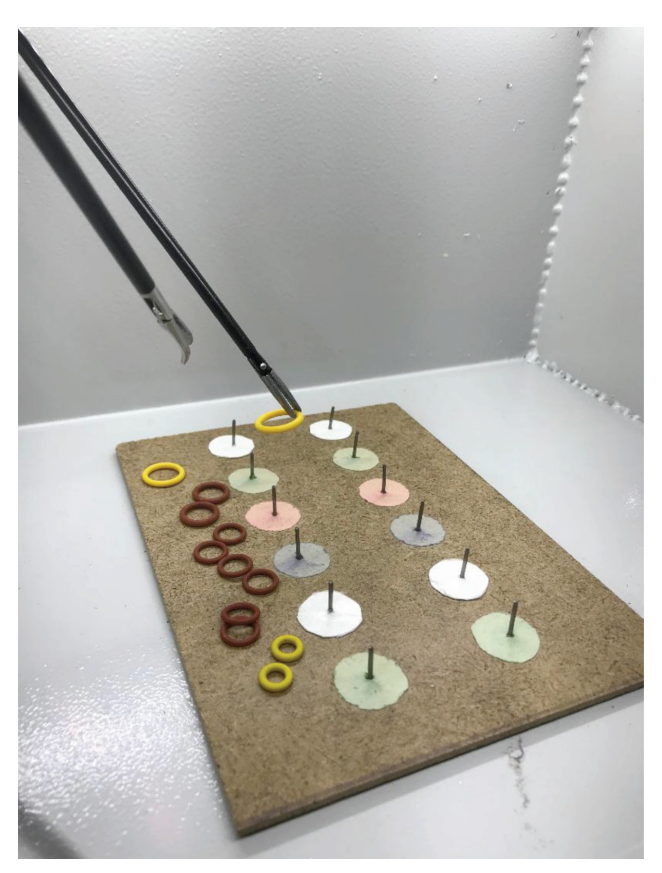
Fig. 2 Training module 1.