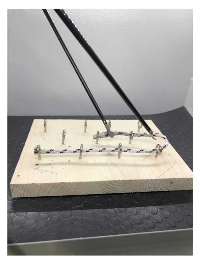
Fig. 5 Training module 4.

paying attention to their colors and sizes. In this process, the surgeon should also change the rings between the right and left hands.