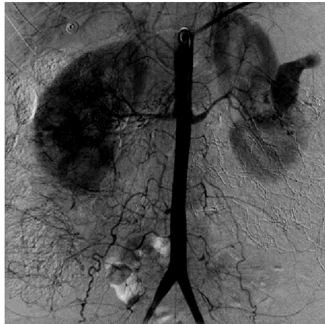
Fig. 1 Arteriography demonstrating extravasation of contrast by the ruptured aneurysm.

Once the patient was stable, an emergency arteriography showed contrast extravasation by the left renal peripheral branch located in the inferolateral region (► Fig. 1), and a super selective catheterization with embolization was requested. However, an abdominal USG exam evidenced a large amount of blood in the abdominal cavity, and owing to the risk of Disseminated intravascular coagulation (DIC), a new approach to cavity lavage was discussed with the general surgeon. In this approach, there was the presence of blood in the abdominal cavity that culminated in a new retroperitoneal tamponade and in a reapproach in between 48 and 72 hours. The patient remained in ICU care, still with VAD and OTI, for 2 days, when a new approach was taken; an ischemic lesion in the sigmoid was found, thus requiring sigmoidectomy. During the following days, there were adjustments to the antibiotic therapy, to