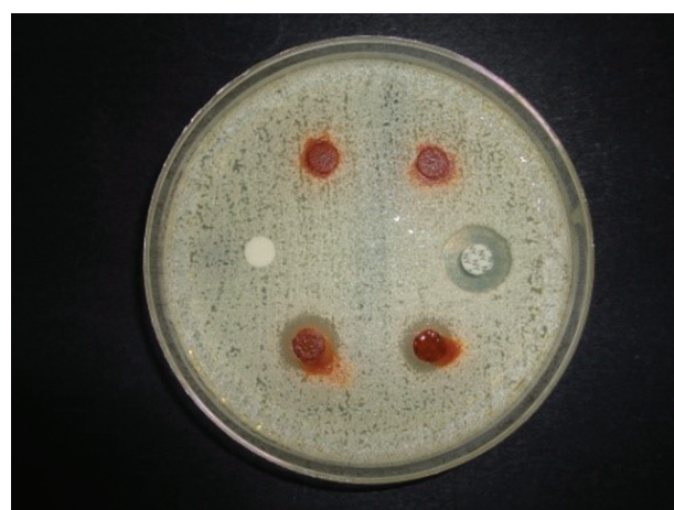
Fig. 2 Picture of the experiment: Sabouraud agar plate seeded with C. krusei , incubated at 37 \pm 2^\circ\text{C} for 24 hours; samples performed in duplicate. Disk no. 1: blank disc without product, study control; disks no. 2 and no. 3: impregnated with S. terebinthifolius Raddi, no inhibition halo observed; disk no. 4: with 100 IU nystatin and inhibition halo observed, experiment control; and nystatin disks no. 5 and no. 6: impregnated with S. terebinthifolius Raddi, showing smaller inhibition halo. Source: Faculdade de Ciências Médicas da Santa Casa de São Paulo, 10/06/2015.