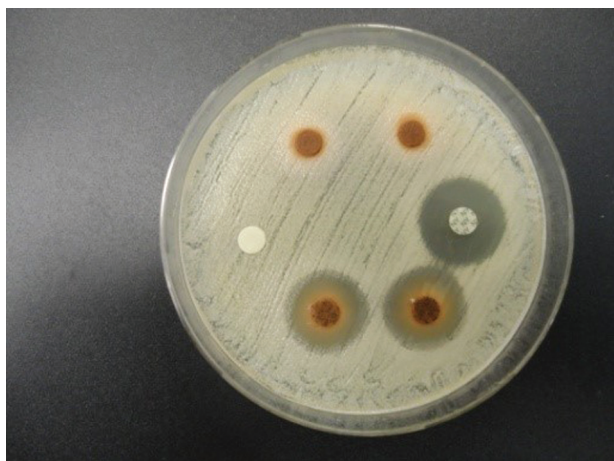
Fig. 3 Picture of the experiment: Sabouraud agar plate seeded with C. glabrata , incubated at 37 \pm 2^\circ\text{C} for 24 hours; samples performed in duplicate. Disk no. 1: blank disc without product, study control; disks no. 2 and no. 3: impregnated with S. terebinthifolius Raddi, no inhibition halo observed; disk no. 4: with 100 IU nystatin and inhibition halo observed, experiment control; and nystatin disks no. 5 and no. 6: impregnated with S. terebinthifolius Raddi, showing smaller inhibition halo. Source: Faculdade de Ciências Médicas da Santa Casa de São Paulo, 10/06/2015.