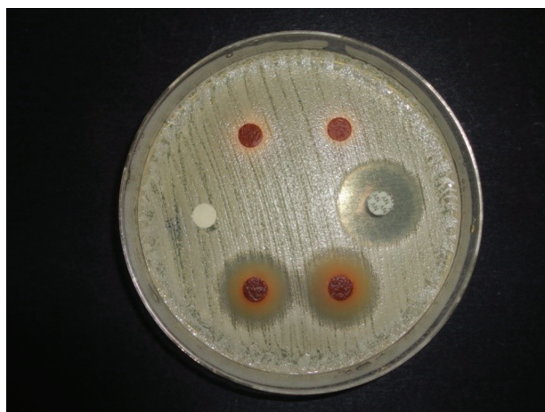
Fig. 1 Picture of the experiment: Sabouraud agar plate seeded with C. albicans , incubated at 37 \pm 2^\circ\text{C} for 24 hours; samples performed in duplicate. Disk no. 1: blank disc without product, study control; disks no. 2 and no. 3: impregnated with S. terebinthifolius Raddi, no inhibition halo observed; disk no. 4: with 100 IU nystatin and inhibition halo observed, experiment control; and nystatin disks no. 5 and no. 6: impregnated with S. terebinthifolius Raddi, showing smaller inhibition halo.

►Table 2 shows the comparisons at 24 hours of the different samples of the aqueous extract of S. terebinthifolius Raddi, nystatin, and the association of nystatin + aqueous extract of S. terebinthifolius Raddi relative to the CA and NCA strains; the results were significant ( p < 0.05 ).